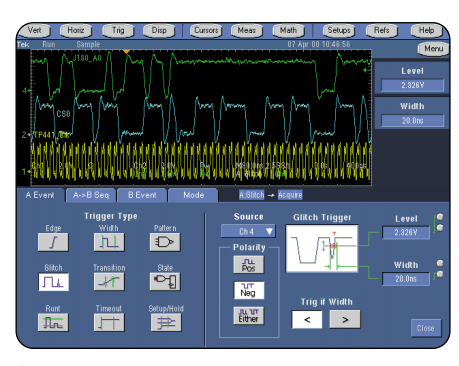
Figure 2. Extensive use of illustrations helps users locate advanced features quickly and apply them with confidence.

The TDS7000 Series graphical user interface delivers sophisticated capability to advanced users without intimidating occasional users. The front panel includes a complete set of classic analog-style controls for most commonly used features. For advanced use, the combination of large 10.4 in. (264 mm) touch sensitive display and graphical interface creates a highly visual environment with explicit illustration of instrument features. The waveform display area remains visible even when