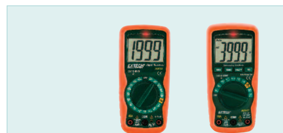
CAT III rated MultiMeter functions