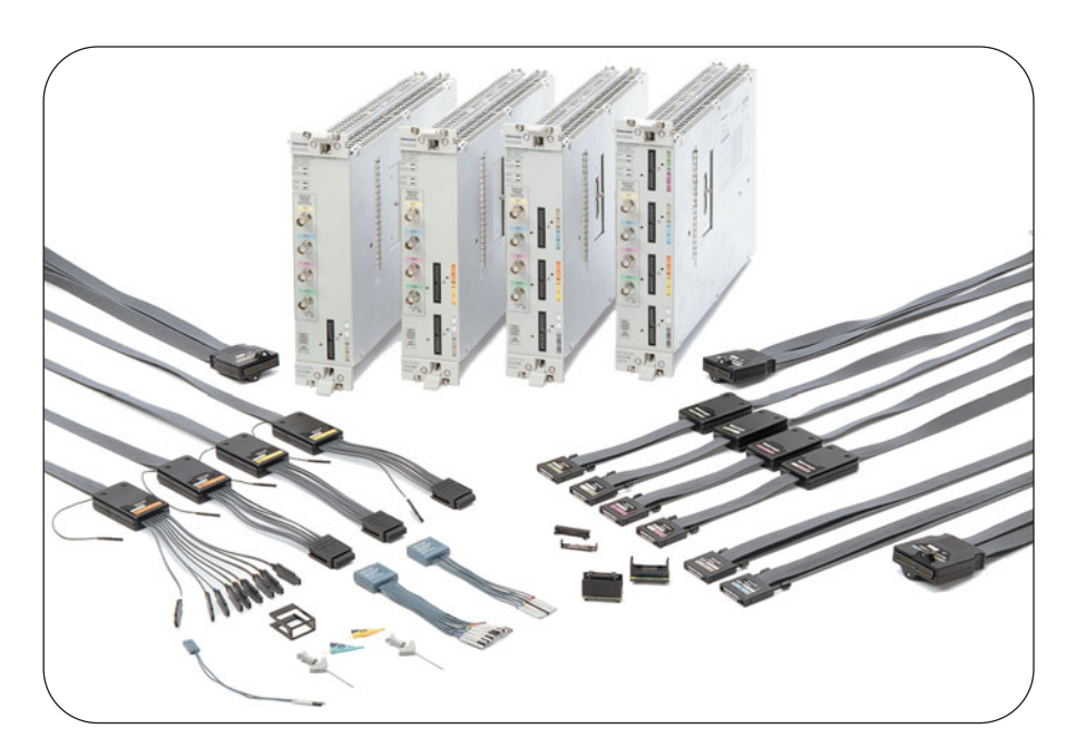
The TLA700 Series offers the highest performance for today's demanding applications and consists of portable and benchtop modular mainframes with expansion mainframe capability.