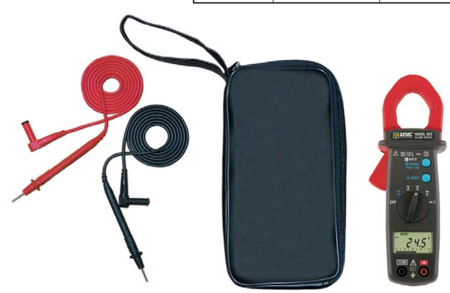
Models 500, 501, 502 & 503 include a pair of test leads and soft carrying case