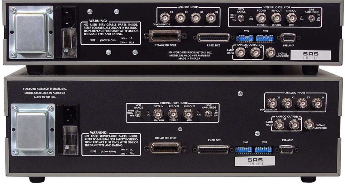
SR510 and SR530 rear panels (with opt. 01)