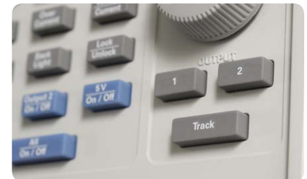
Figure 3. Simplifies Output 1 and Output 2 setup with tracking feature