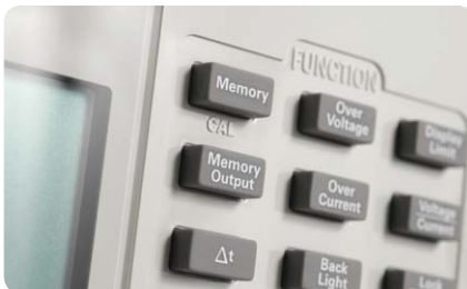
Figure 1. Output sequencing made easy with intuitive keypads

Both models of the U8030 series come with a set of features to suit your needs while remaining easy to use. The LCD screen displays both voltage and current readings in a one-view panel while the all ON/OFF button allows multiple outputs to be controlled simultaneously. Additionally, the auto-track feature simplifies setup between output 1 and output 2. With these, you get a solid bench power supply plus a set of convenient and easy to use features.