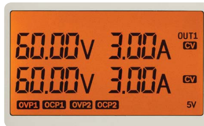
Figure 2. Backlight on/off feature with dual reading (voltage and current) on an LCD display