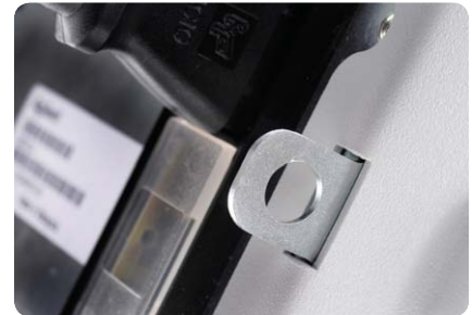
Physical lock mechanism as illustrated

Essential security features: Over-voltage protection (OVP)/ Over-current protection (OCP), keypad lock and physical lock mechanism