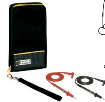
Models F01, F03, F05, F07 and F09 include test leads, soft carrying case and user manual.

Jaw Opening: ≤1.02" (26mm) Conductor Size: one 500 MCM cable