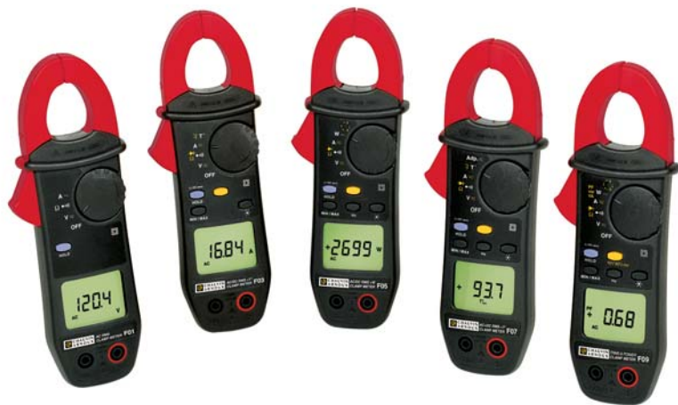
Models F01, F03, F05, F07 & F09