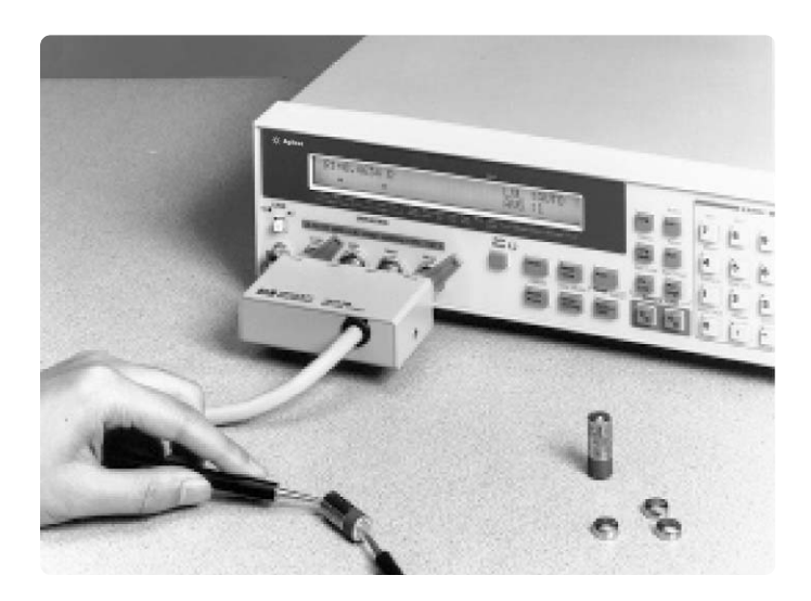
The 4338B is ideal for battery evaluation.