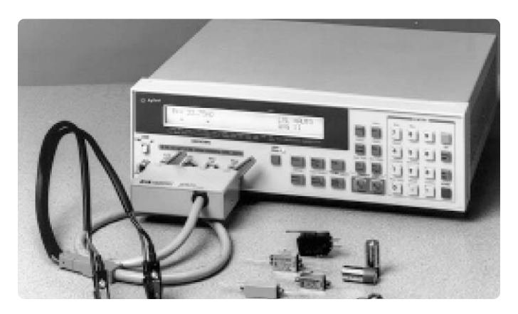
Use the milliohm meter for electromechanical contact testing.